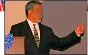
Dana La Mon 1992 World Champion of Public Speaking