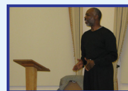
Accepting his own challenges